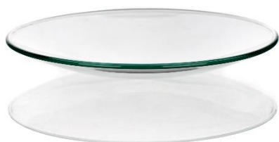
Scheme of the glass item